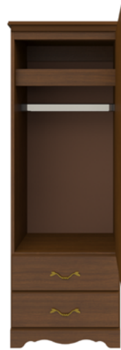
Model: CHWR21R 25W 23.75D 71H

The Charlotte Collection is the perfect fit for any traditional senior living environment. Gently radiused corners and OG edging protects fragile skin, while the styling uplifts and restores the spirit. Raised cabinetry promises ease of cleaning below case goods.